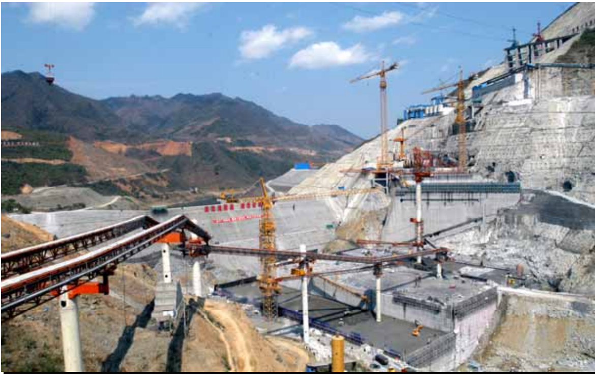
Figure 4: The High Speed Conveyor Belt & Tower Belt Cranes System at Longtan RCC Dam

Three high speed belt conveyer concrete supply lines and two tower belt cranes have been used for horizontal and vertical concrete transportation and pouring system. The total concrete volume for Longtan dam is up to 6.6 million \text{m}^3 , of which RCC accounts for 4.48 million \text{m}^3 and conventional concrete is 2.12 million \text{m}^3 . Total product aggregate required is up to 14.12 million tons. The aggregate is made of limestone and the capability of sand and stone processing system is 2500t/h.