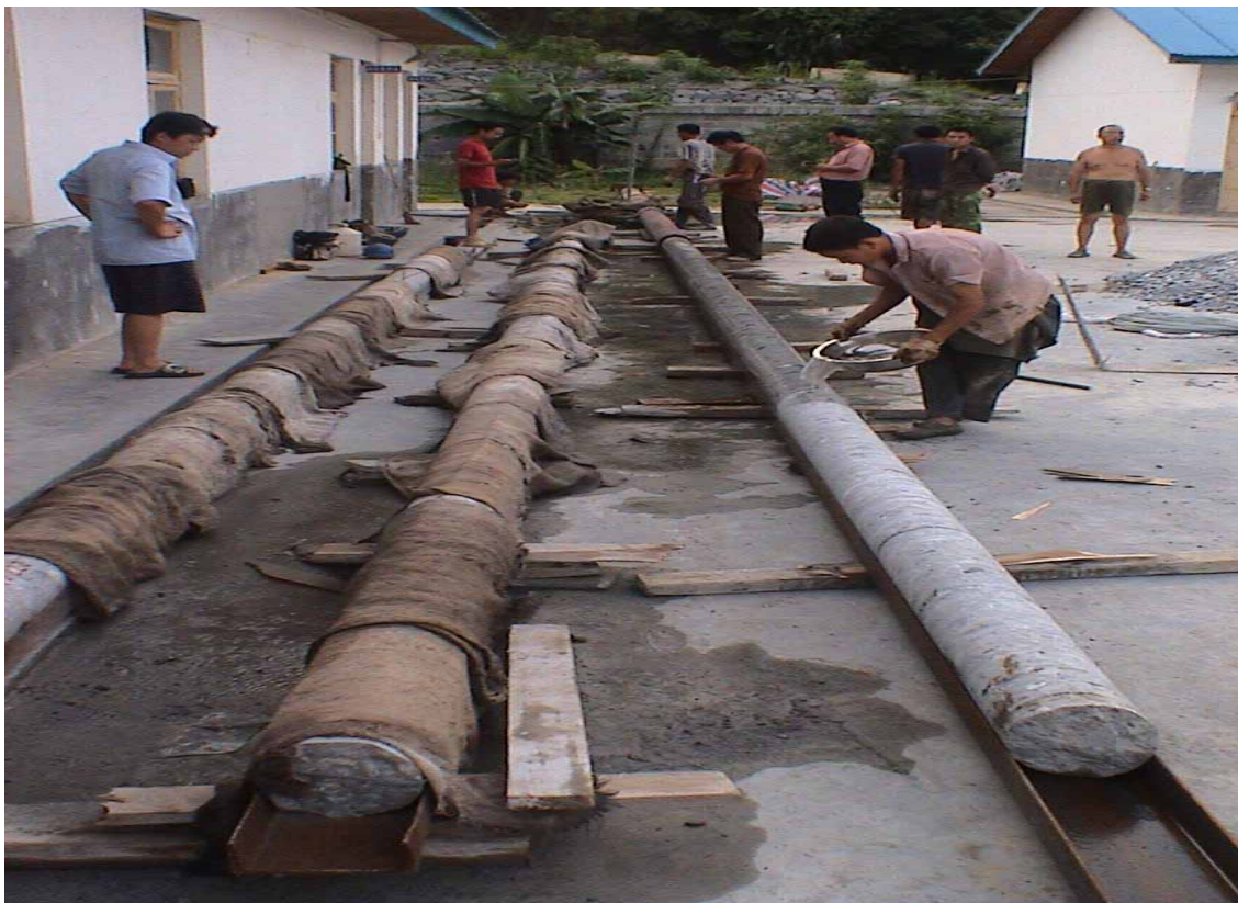
Figure 3: The RCC Cores of Longtan Dam

On the basis of a lot of laboratory and field test and research, finally the mix proportions for the three RCC zones of Longtan dam were determined. In order to meet the requirement of all-year-around construction of Longtan dam under high temperature, high effective retarding water reducer and aeration agent suiting Longtan RCC were selected. The maximum length of a single drilled RCC core is 15.03m as shown in Figure 3. The core has smooth surface, compact structure and evenly-distributed aggregates.