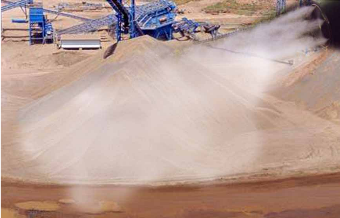
Figure 6: Evaporative Cooling of Stockpiles