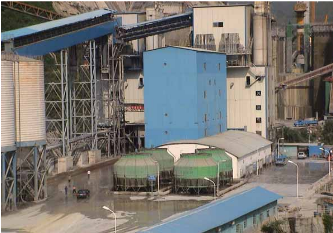
Figure 7: The Ice Plant and Cooling Tower at Longtan RCC Dam